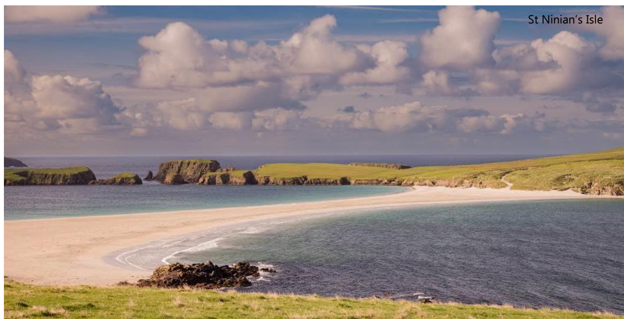
St Ninian's Isle

Shetland's regular inter-island ferry service ensures we have access to many of the outer islands. The weather and local timetable of each sailing will determine which island we end up on.