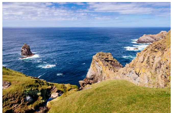
From top: Puffins, Red-necked Phalarope, Unst